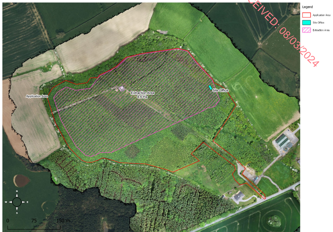
Figure 9.B3: Operational Phase