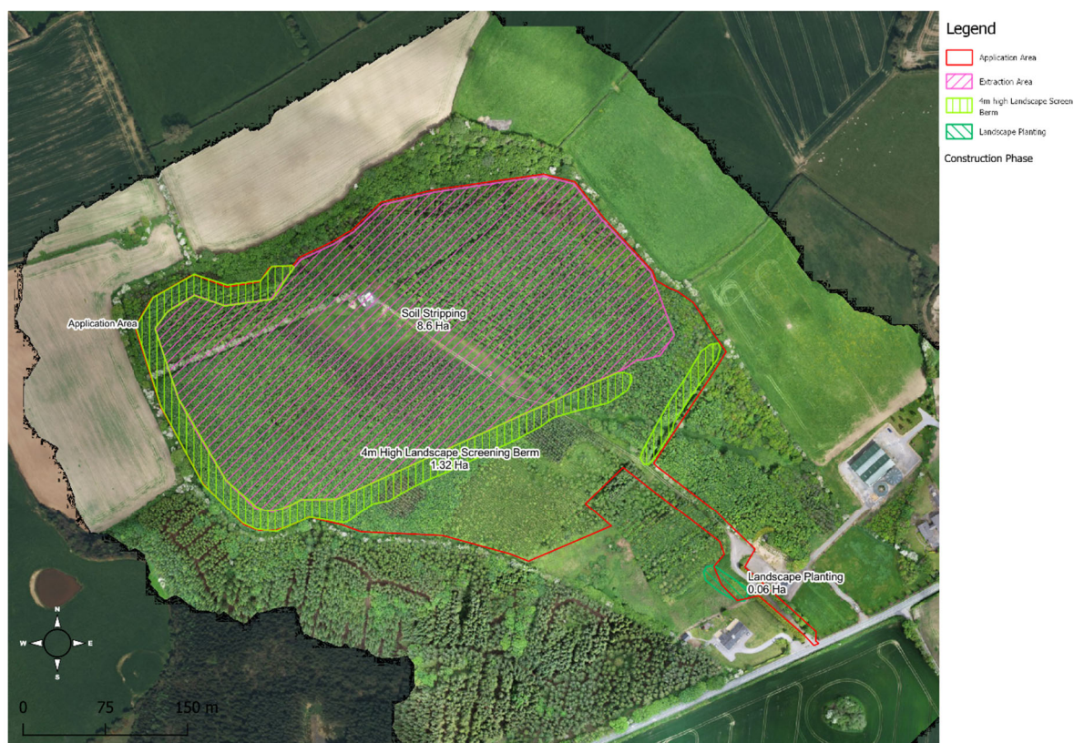
Figure 9.B2: Construction Phase