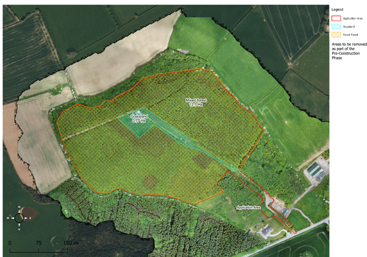
Figure 9.B1: Areas to be removed during the pre-construction phase

9.3 Figure 9.B1 shows the areas to be removed during the pre-construction phase.