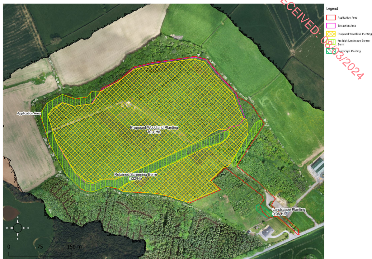
Table 9.B4: Woodland Planting